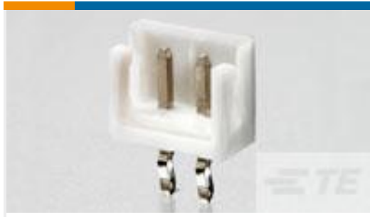
TE Part # 440052-7 2.5MM,HDR,7POS,VERTICAL, CONNECTOR