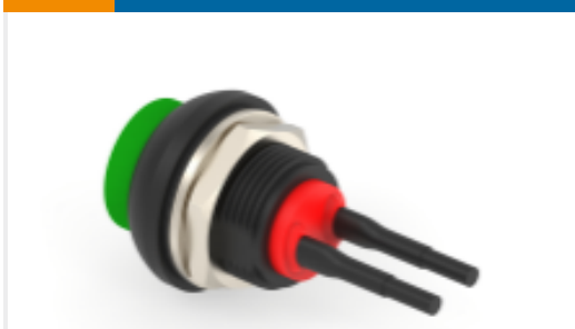
TE Part # 2329359-9 PB ON/OFF HC GRE M1 TERM IP68 500MM LHS