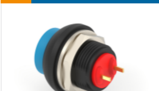
TE Part # 2-2329328-0 PB OFF/ON HC BLU M4 TERM. IP68