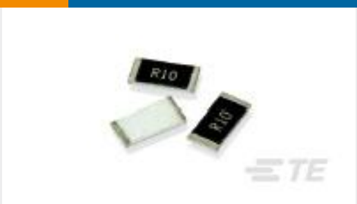
TE Part # 2-1879461-5 RL73H 2A R13 1% 1K RL