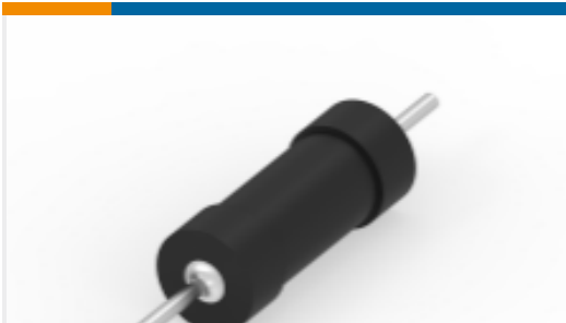
TE Part # 1879623-8 H4 1K3 0.1% 5PPM