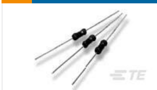
TE Part # 1-1625893-3 5W SM M/OX 2% 22R