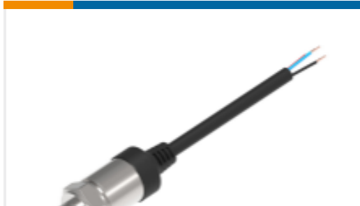
TE Part # 20014203-12 PRESS XDCR M325M-000005-250PG