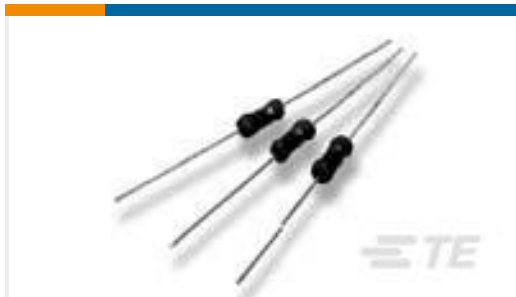
TE Part # 1-1625893-3 5W SM M/OX 2% 22R