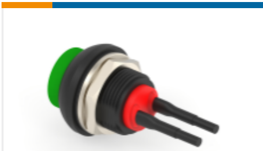
TE Part # 2329359-9 PB ON/OFF HC GRE M1 TERM IP68 500MM LHS