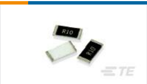
TE Part # 2-1879461-5 RL73H 2A R13 1% 1K RL