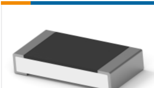
TE Part # 1-2176391-0 RQ 1206 15K4 0.1% 10PPM 5K RL