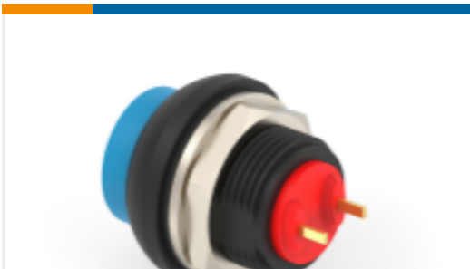
TE Part # 2-2329328-0 PB OFF/ON HC BLU M4 TERM. IP68