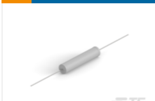
TE Part # 9-2176415-0 8W STD M/OX 5% 150K