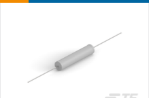
TE Part # 9-2176415-1 8W STD M/OX 5% 160K