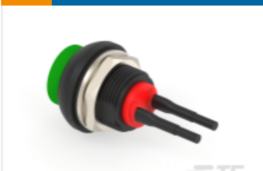
TE Part # 2329359-9 PB ON/OFF HC GRE M1 TERM IP68 500MM LHS