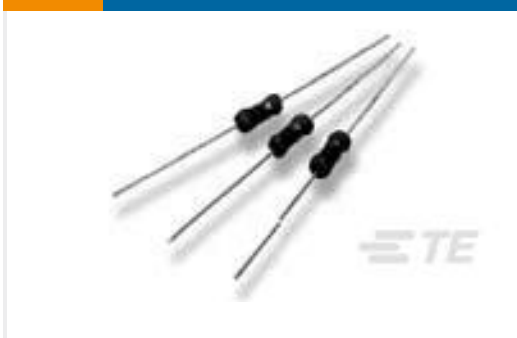
TE Part # 1-1625893-3 5W SM M/OX 2% 22R