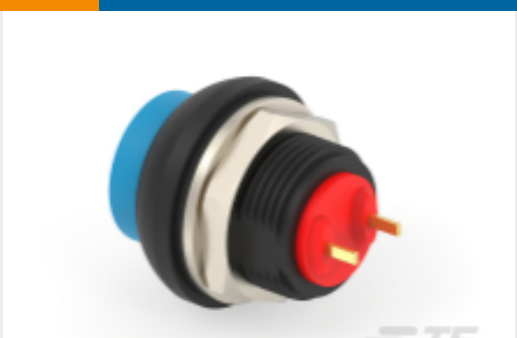
TE Part # 2-2329328-0 PB OFF/ON HC BLU M4 TERM. IP68