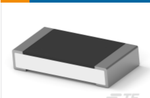
TE Part # 1-2176391-0 RQ 1206 15K4 0.1% 10PPM 5K RL