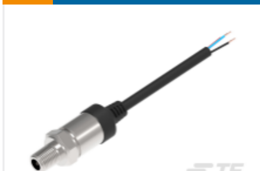
TE Part # 20014203-12 PRESS XDCR M325M-000005-250PG