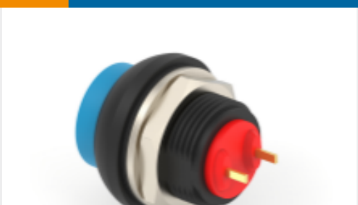
TE Part # 2-2329328-0 PB OFF/ON HC BLU M4 TERM. IP68