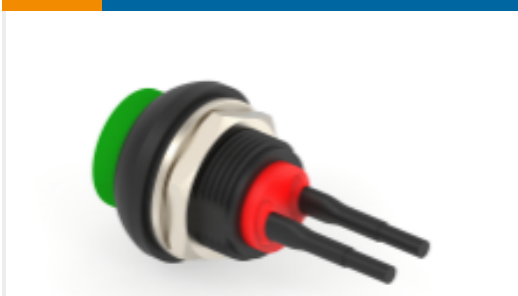
TE Part # 2329359-9 PB ON/OFF HC GRE M1 TERM IP68 500MM LHS