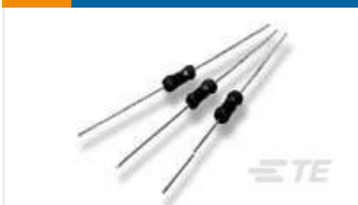
TE Part # 1-1625893-3 5W SM M/OX 2% 22R