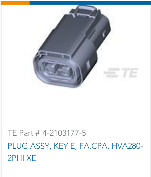
TE Part # 4-2103177-5 PLUG ASSY, KEY E, FA,CPA, HVA280-2PHI XE