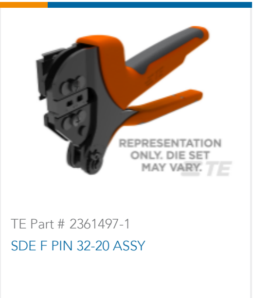
TE Part # 2361497-1 SDE F PIN 32-20 ASSY