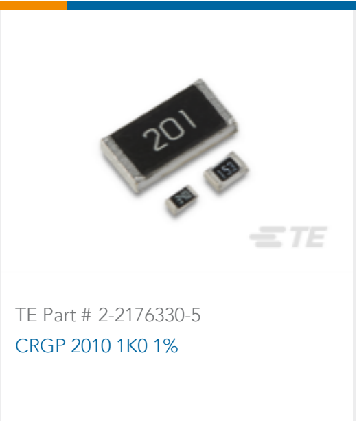
TE Part # 2-2176330-5 CRGP 2010 1K0 1%