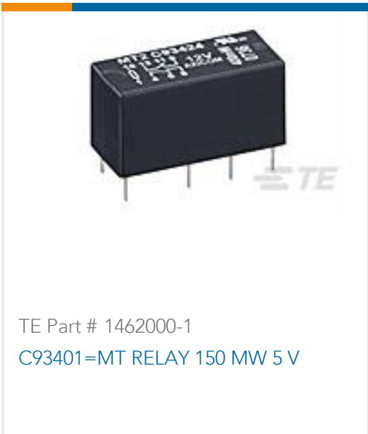
TE Part # 1462000-1 C93401=MT RELAY 150 MW 5 V