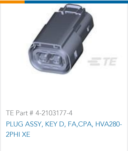
TE Part # 4-2103177-4 PLUG ASSY, KEY D, FA,CPA, HVA280-2PHI XE