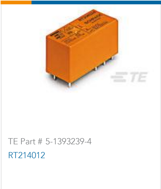
TE Part # 5-1393239-4 RT214012