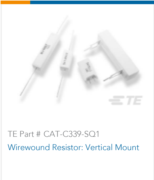
TE Part # CAT-C339-SQ1 Wirewound Resistor: Vertical Mount