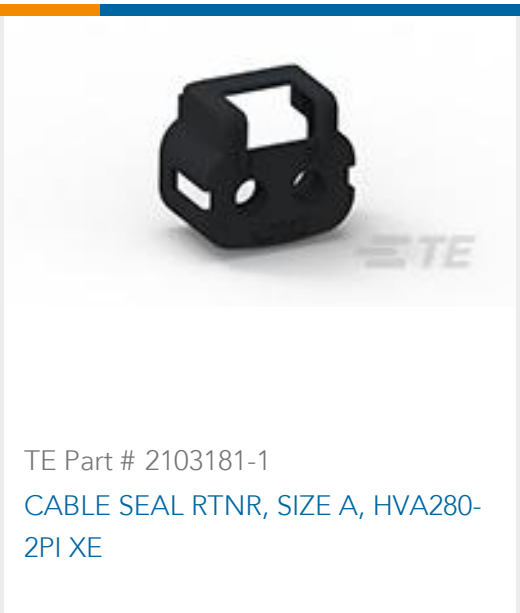
TE Part # 2103181-1 CABLE SEAL RTNR, SIZE A, HVA280-2PI XE