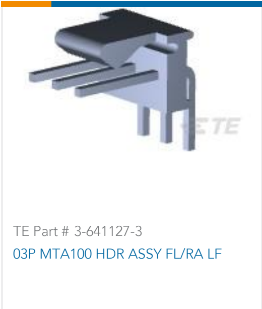
TE Part # 3-641127-3 03P MTA100 HDR ASSY FL/RA LF