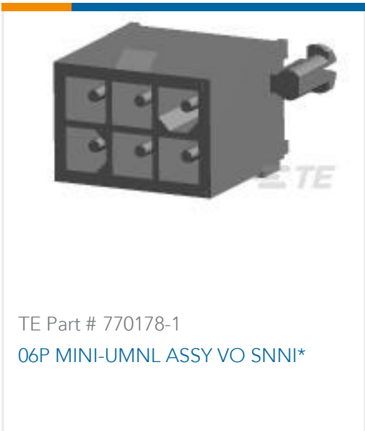
TE Part # 770178-1 06P MINI-UMNL ASSY VO SNNI*