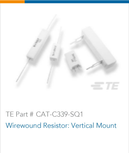
TE Part # CAT-C339-SQ1 Wirewound Resistor: Vertical Mount

This information is provided based on reasonable inquiry of our suppliers and represents our current actual knowledge based on the information they provided. This information is subject to change. The part numbers that TE has identified as EU RoHS compliant have a maximum concentration of 0.1% by weight in homogenous materials for lead, hexavalent chromium, mercury, PBB, PBDE, DBP, BBP, DEHP, DIBP, and 0.01% for cadmium, or qualify for an exemption to these limits as defined in the Annexes of Directive 2011/65/EU (RoHS2). Finished electrical and electronic equipment products will be CE marked as required by Directive 2011/65/EU. Components may not be CE marked. Additionally, the part numbers that TE has identified as EU ELV compliant have a maximum concentration of 0.1% by weight in homogenous materials for lead, hexavalent chromium, and mercury, and 0.01% for cadmium, or qualify for an exemption to these limits as defined in the Annexes of Directive 2000/53/EC (ELV). Regarding the REACH Regulation, the information TE provides on SVHC in articles for this part number is based on the latest European Chemicals Agency (ECHA) 'Guidance on requirements for substances in articles' posted at this URL: https://echa.europa.eu/guidance-documents/guidance-on-reach