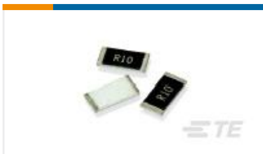
TE Part # 2-1879461-5 RL73H 2A R13 1% 1K RL