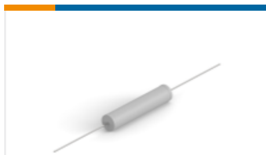
TE Part # 9-2176415-1 8W STD M/OX 5% 160K