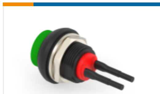
TE Part # 2329359-9 PB ON/OFF HC GRE M1 TERM IP68 500MM LHS