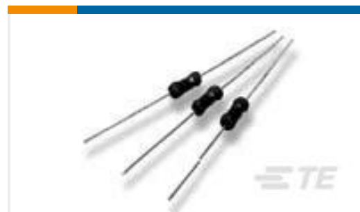
TE Part # 1-1625893-3 5W SM M/OX 2% 22R