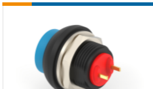
TE Part # 2-2329328-0 PB OFF/ON HC BLU M4 TERM. IP68