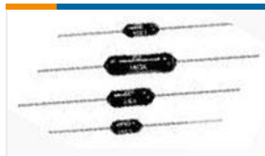
TE Part # 5-1879642-1 H8 5K0 0.1% 25PPM