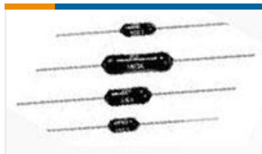
TE Part # 2-1879622-2 H4P 1M0 1% 50PPM